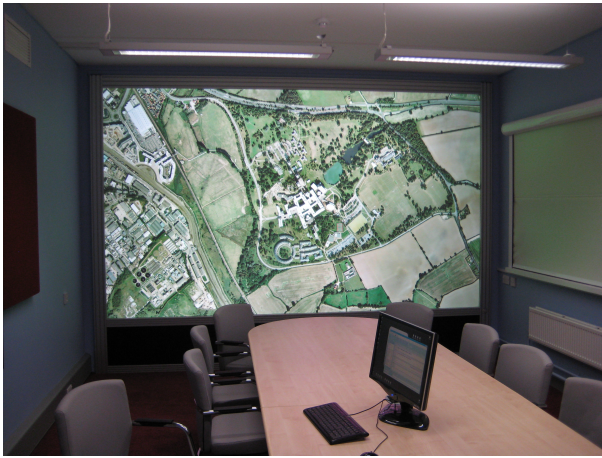
Fig. 2. 8k Auditorium at University of Essex

of reality and greater sense of presence compared to other existing digital media formats. The NML [6] is an interdisciplinary laboratory focused on research and development for the deployment of UHD media applications over high performance communication networks. It is one of the few network connected UHD facilities in the world and is equipped with visualisation facilities for emerging 4K 3D and 8K media formats. Within the VISIONAIR framework, the NML is providing advanced network technologies for application-aware delivery of future networked UHD applications (including UHD VR applications) and remote collaborations between researchers. In addition, it is providing access to its visualisation facilities as well as its extensive network infrastructure comprising connections to UK, European and International locations through 1 and 10 Gbps lightpath connectivity.