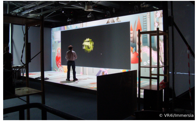
Fig. 3. One of the CAVEs at INRIA

The VR4i, Virtual Reality for Improved Innovative Immersive Interaction, team is located at Rennes together with IRISA. The main purpose of the VR4i team is to improve the interaction of users with and through virtual worlds. Our main research activity is concerned with real-time simulation of complex dynamic systems, and we investigate real-time interaction between users and these systems. We address mechanical simulation, control of dynamic systems, real-time simulation, haptic interaction, multimodal interaction,