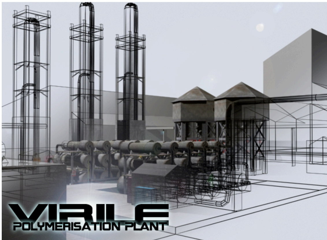
Figure 1. The Virtual Processing Plant