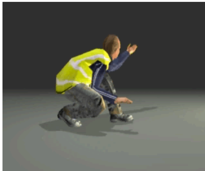
Figure 3. Demonstrating Varying Levels of Realism in the Representation of a Virtual Worker