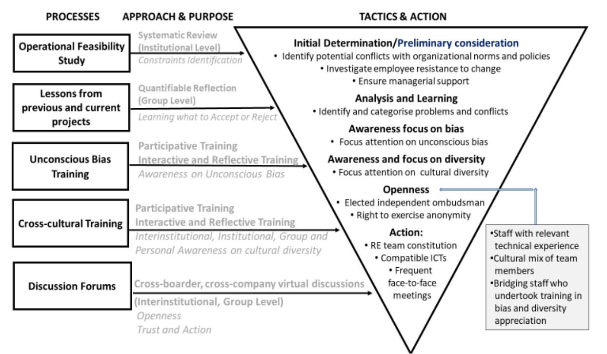
Figure 1: The first version of the pictorial representation of the McRE framework.